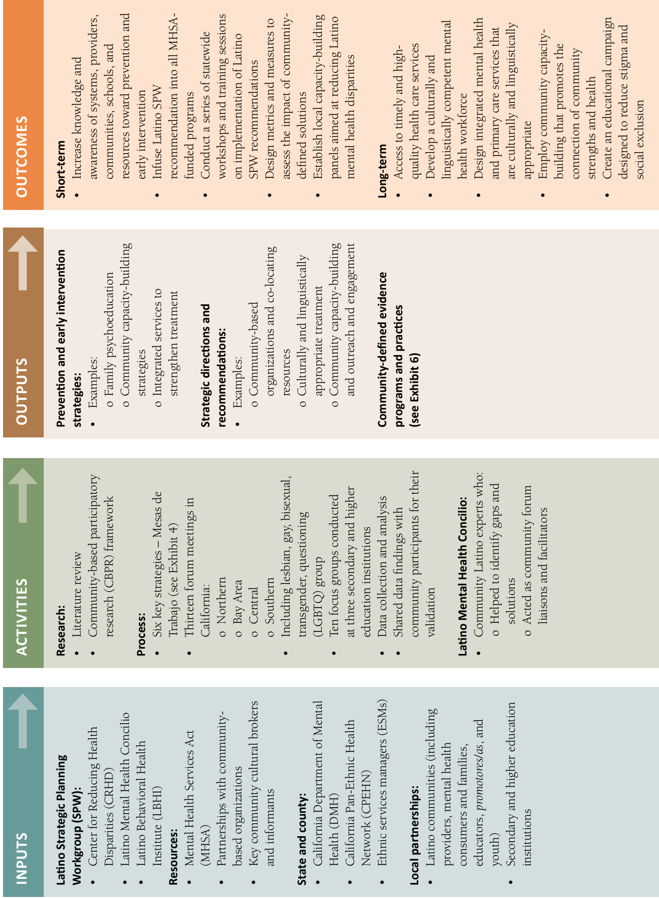
Exhibit 3. Logic Model of the Community-Defined Solutions for Latino Mental Health Care Disparities Project